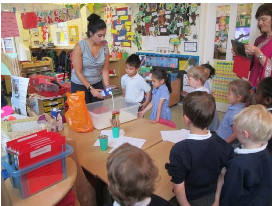
We enjoyed learning about India, Finland and Africa!

Parents have been helping us to celebrate cultural diversity by giving Foundation Stage some fantastic talks and experiences!